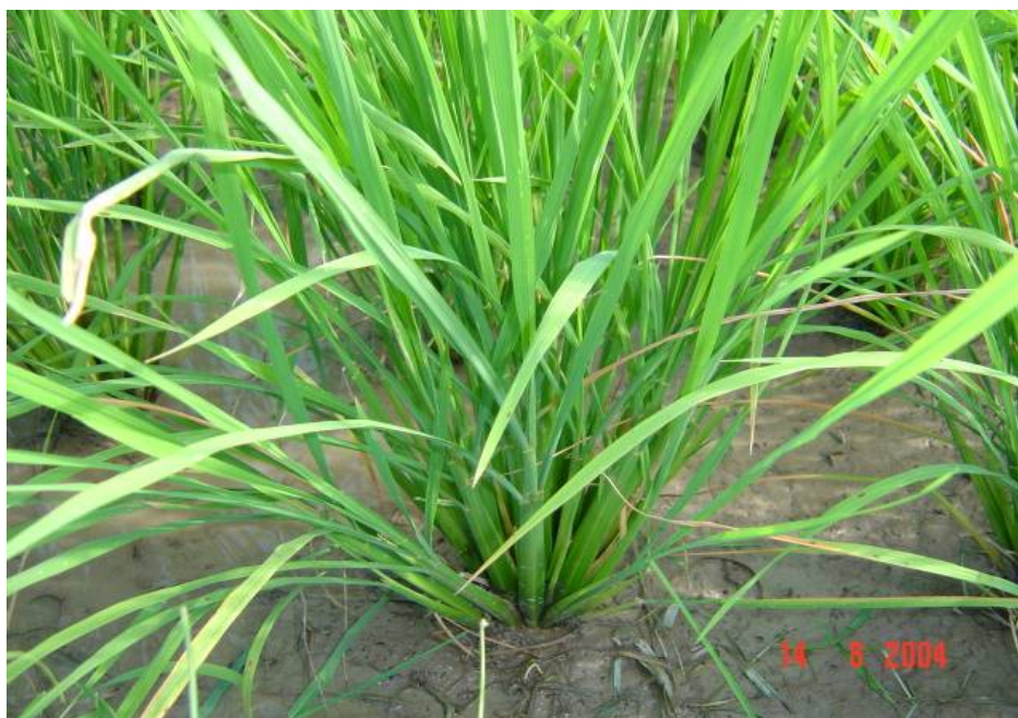
Figure 2: SRI rice plant 3 weeks after transplanting of one seedling

CEDAC's experiences with SRI in Cambodia in the last seven years have shown that if farmers can adopt all, or most of SRI principles and techniques they are able to benefit from increased rice yields by more than 2 to 3 times. The best SRI users are able to obtain 4-6 tons per hectare or more. But if they cannot adopt all, or most of the principles and techniques, just by reducing the number of seedling used per clump, the age of seedlings, and the depth of transplanting, they can achieve a significant yield increase (around 30 to 50%) and also save seeds (which is important for poor households).