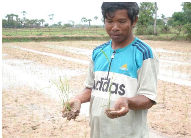
Figure 1 : Transplanting young and one seedling